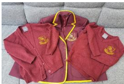
Blazers are optional