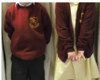
Blazers are optional